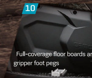
Full-coverage floor boards and gripper foot pegs