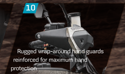
Rugged wrap-around hand guards reinforced for maximum hand protection